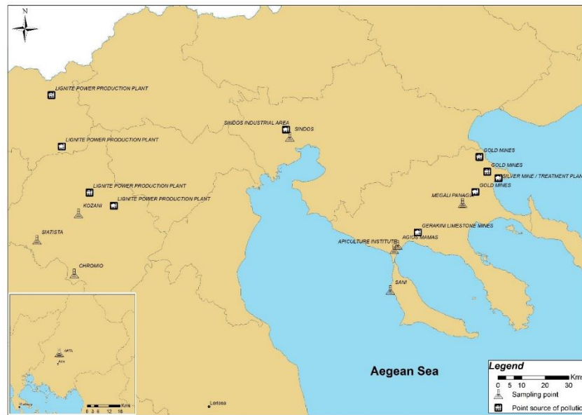
Figure 1. Sampling areas and industrialized activities.